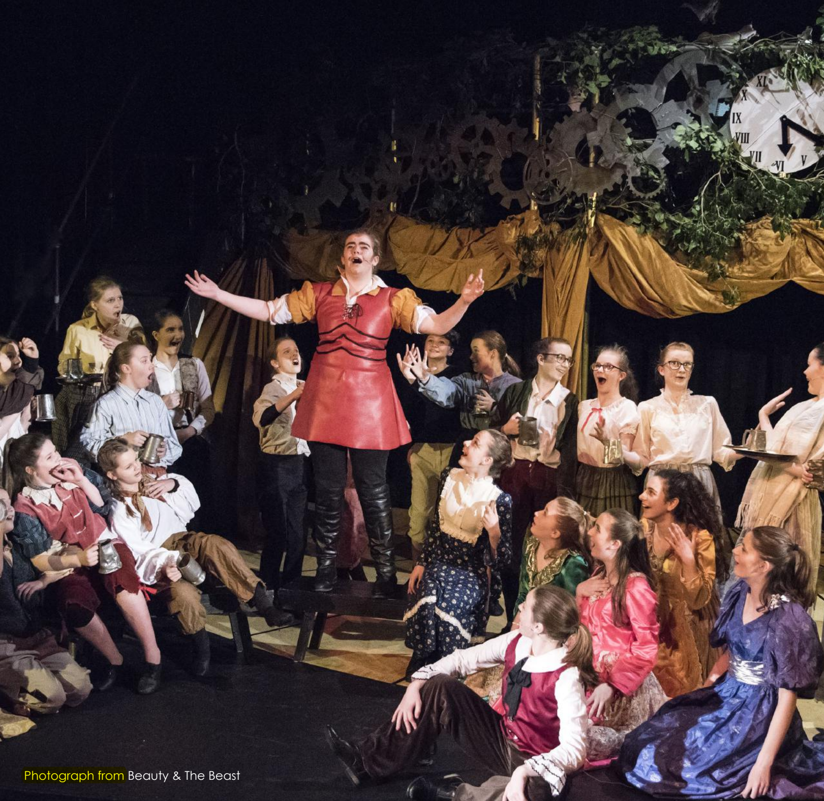
Photograph from Beauty & The Beast