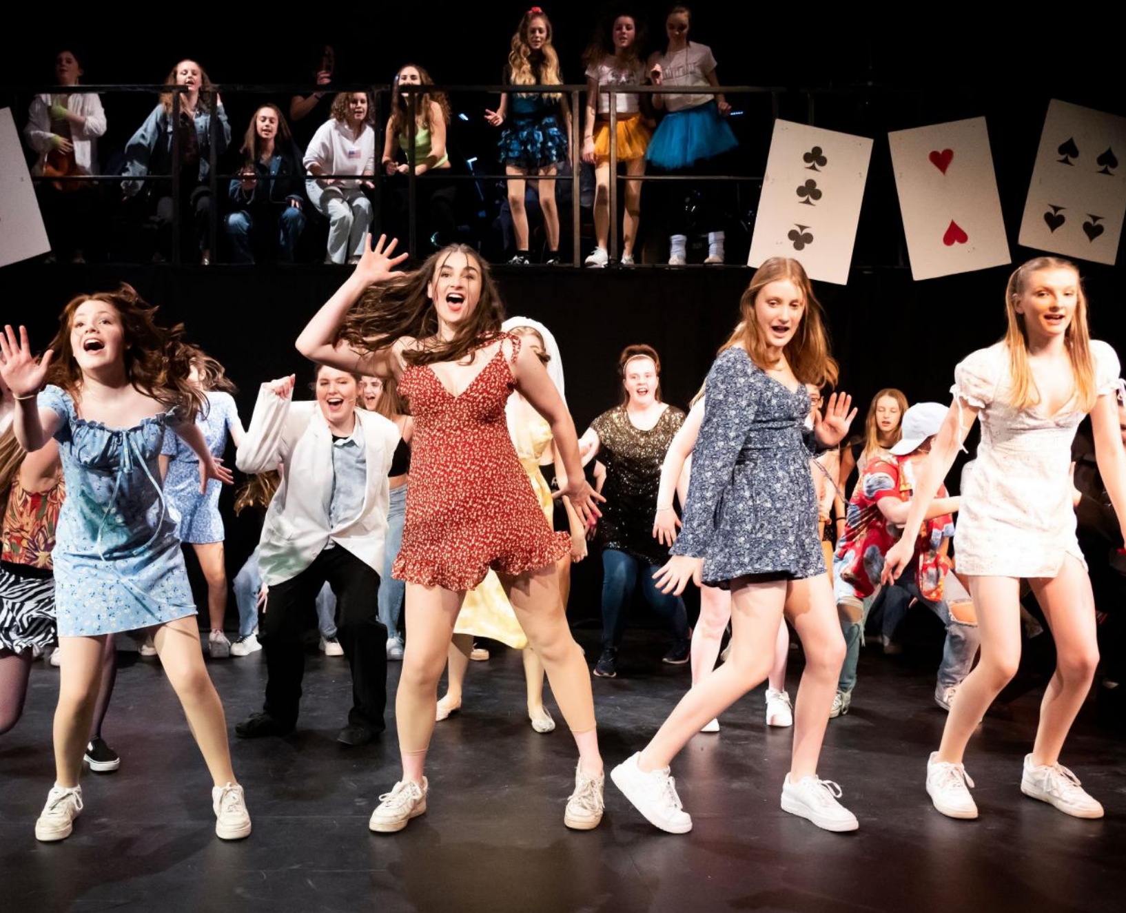
Photograph from Our House: The Madness Musical